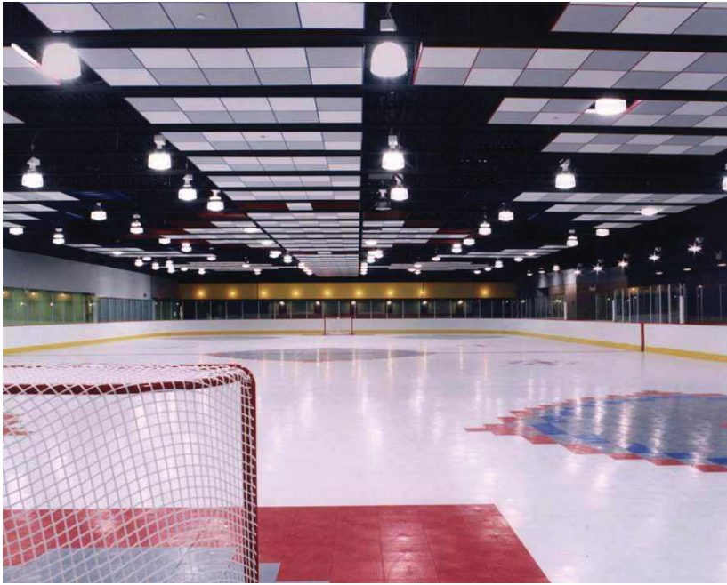
The indoor inline-skating and hockey facility portion of the 2001 IRPA award winning 54,000 Sq. Ft. Mount Prospect Park District Central Community Center in Mount Prospect, IL.

Site Planning and Site Engineering design services for a variety of the Sunrise Assisted Living Facilities in Illinois including: concept planning; public hearing processing; preliminary and final site engineering; process coordination; and promotional plan development.