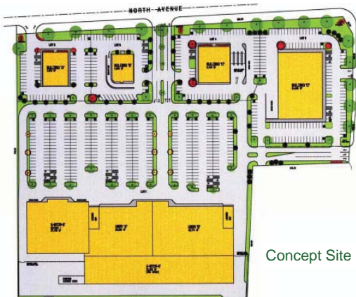
Concept Site Plan